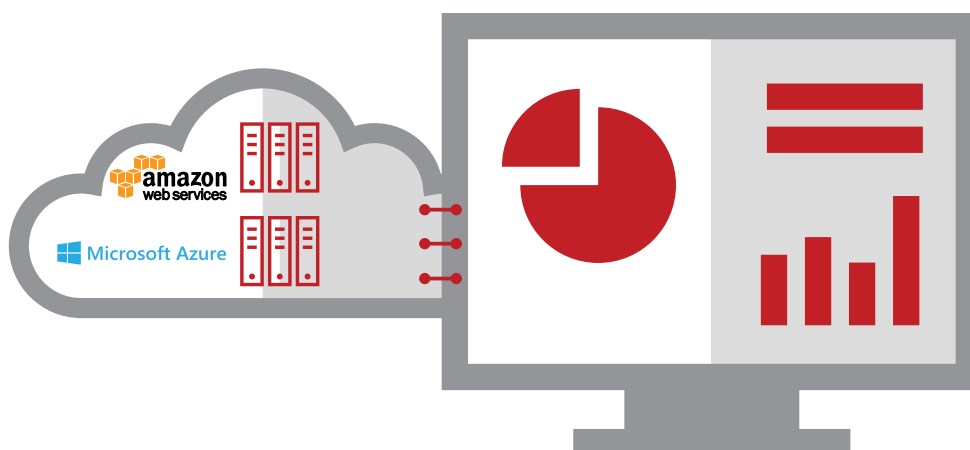
Figure 1. Single management console for multiple cloud infrastructures and multiple McAfee technologies.